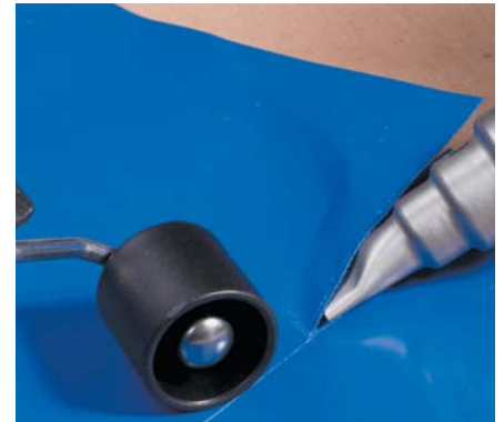
Repair welding PLUS