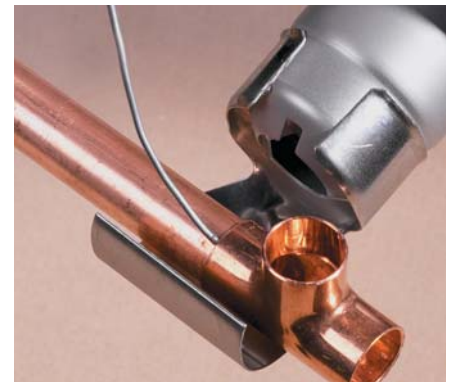
Soldering of copper tubes PRO PLUS