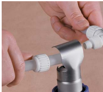
Forming PIC PRO PLUS