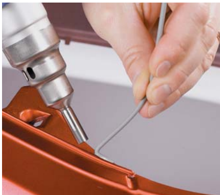
Pendulum welding PLUS