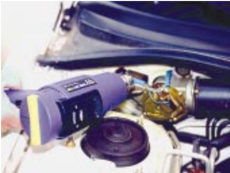
Shrinking a PVC heat-shrink tube.