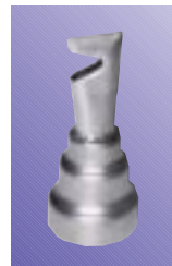
Reflector for solder sleeves.