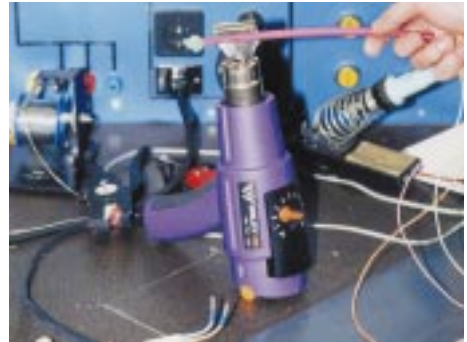
Shrinking a PVC heat-shrink tube with reflector.