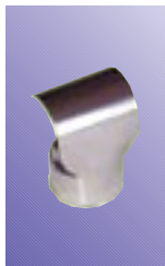
Reflector nozzle for shrinking of heat-shrink tubes.